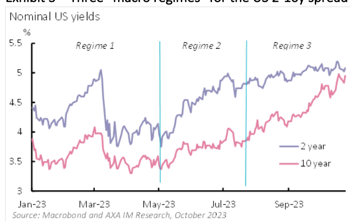
Exhibit 3 - Three "macro regimes" for the US 2-10y spread

Still, it adds to the "higher equilibrium rate" narrative we succinctly explored last week. When looking at the 2 to 10 year spread – under the assumption that the 2-year yield essentially reflect the market's understanding of the current signals from the central bank – we can find three successive "regimes" this year. Last winter 10-year yields were reacting almost 1 for 1 to quick changes in perceptions around the Federal Reserve (Fed)'s strategy. Then, last spring, investors finally understood the central bank "meant business" and 2-year yields rose but without taking 10-year yields with them. This is the typical configuration when the market takes on board the impact of the ongoing monetary tightening on the real economy (i.e., consistent with a recession down the road).