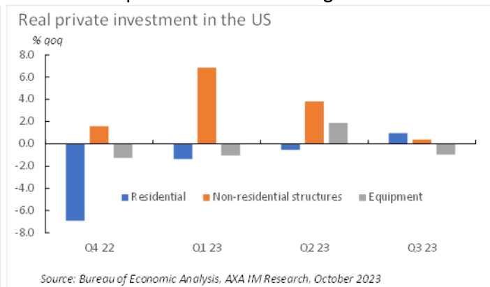
Exhibit 2 – Corporate investment taking a breather?

The market was remarkably non-plussed by the release, while another dollop on tension on bond market could have been expected. This may merely reflect the fact that the market had already made up its collective mind. Even GDP grew more than expected, investors were in any case already bracing themselves for another exuberant print far above the US potential pace.